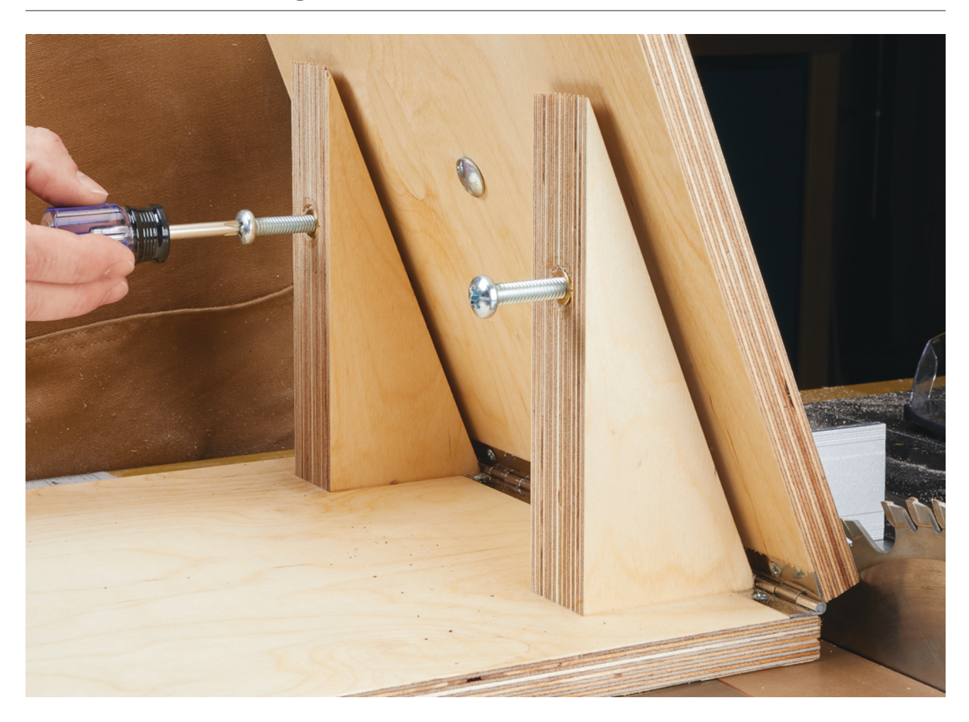
Adjust Angle. Set the position of the platen by turning the two adjustment bolts on the backside of the sled.