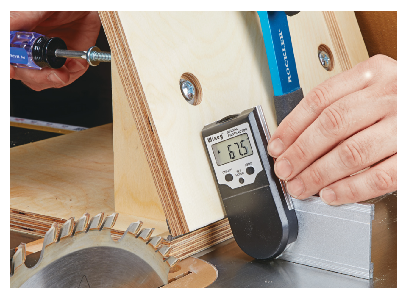
Lock it Down. First, verifying the angle of the platen with a digital angle guide.