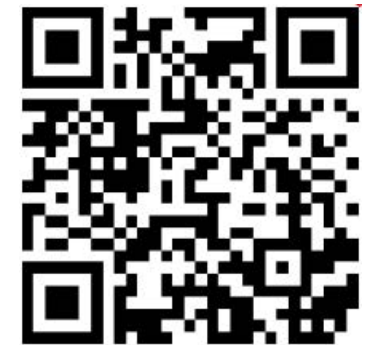
one great example video on how to use the jig